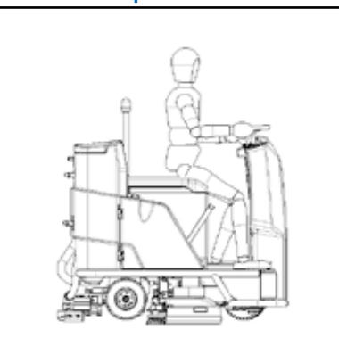
With tall operator