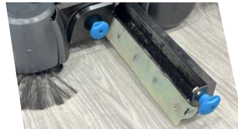
Pull Out Debris Hopper & Brush