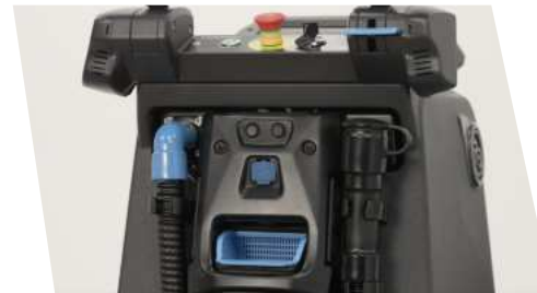
Easy Access To Hoses

The R3 Scrub Pro will be instantly familiar to all users of professional scrubbers. Featuring magnetic designs that require no tools for dismantling, and highlighted blue touch points, you get full accessibility to key areas for maintenance.