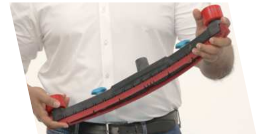
Magnetic Quick Release Squeegee