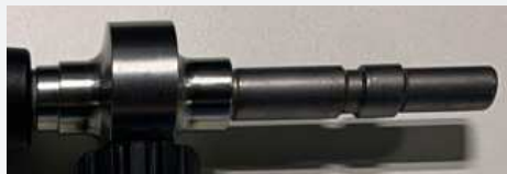
In the image a KEW coupling. This can be tightened using an Allen key.